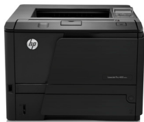
(HP LaserJet Pro 400 M401n)