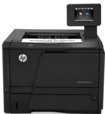
(HP LaserJet Pro 400 M401dn/dw)