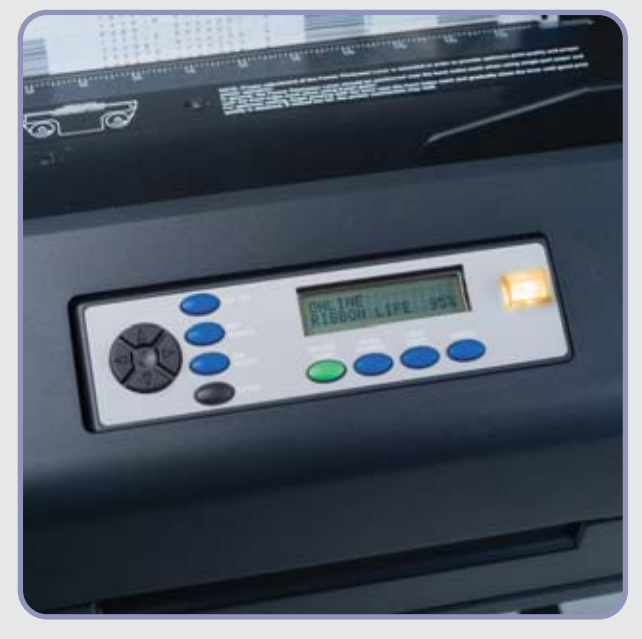
Plan print jobs with precise ribbon life indicated on panel