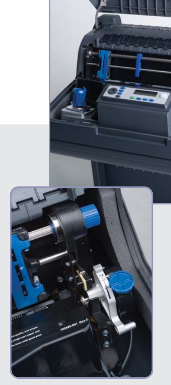
New platen adjustment feature