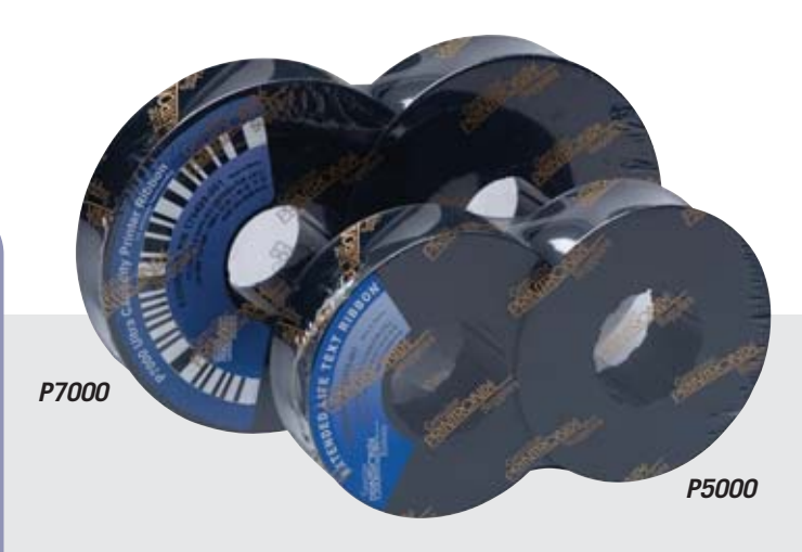
New formulation and larger capacity spool delivers higher performance and lower cost